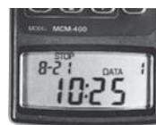
Memory stop time