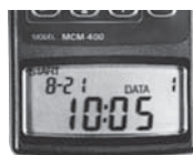
Memory start time